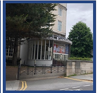
SIDE ENTRANCE, BROWNLOW HILL