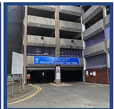
CAR PARK ENTRANCE, MOUNT PLEASANT